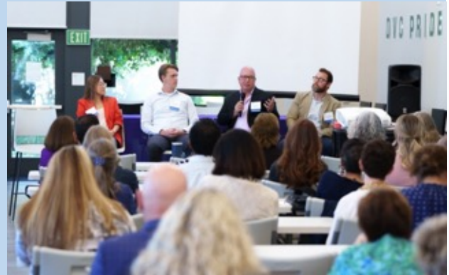
East Bay EDA Meet the Innovators panel.