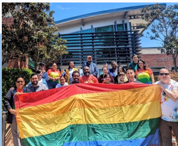
CCC staff and community members celebrating Pride Month